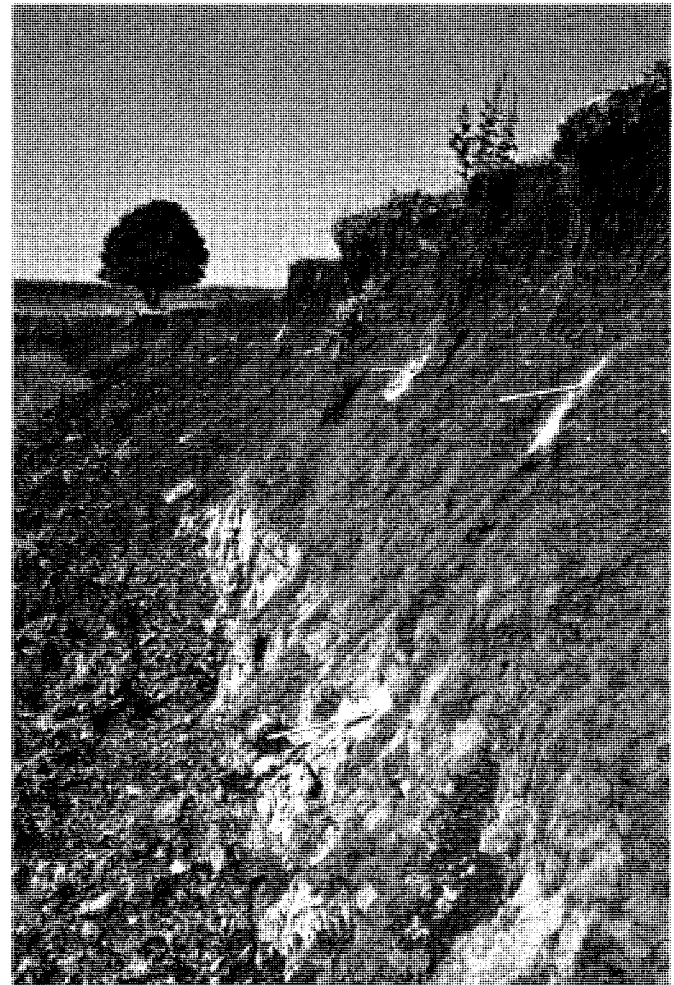
Fig. 2. The placement of erosion pins on a stream bank. The streams bank pin plots had two horizontal rows of pins, placed 1/3 of the bank height apart. The gully bank pin plots had only one horizontal row of pins, placed in the middle of the bank. The horizontal row of the plots had five erosion pins, placed 1 m apart.

The pins were measured five times (initially measured when first installed in the bank) and erosion rates were estimated for four periods: i) Summer 2003 (SU 03), 13 April–12 August 2003; ii) Fall 2003 (FA 03), 13 August–15 November 2003; iii) Spring 2004 (SP 04), 16 November 2003–3 May 2004; and iv) Summer 2004 (SU 04), 4 May 2004–17 August 2004. The pins were not measured during the winter because they were not easily