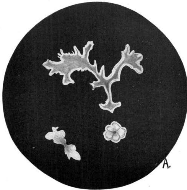
FIG. 1. Colonies in agar plate, 18 hours. Natural size.