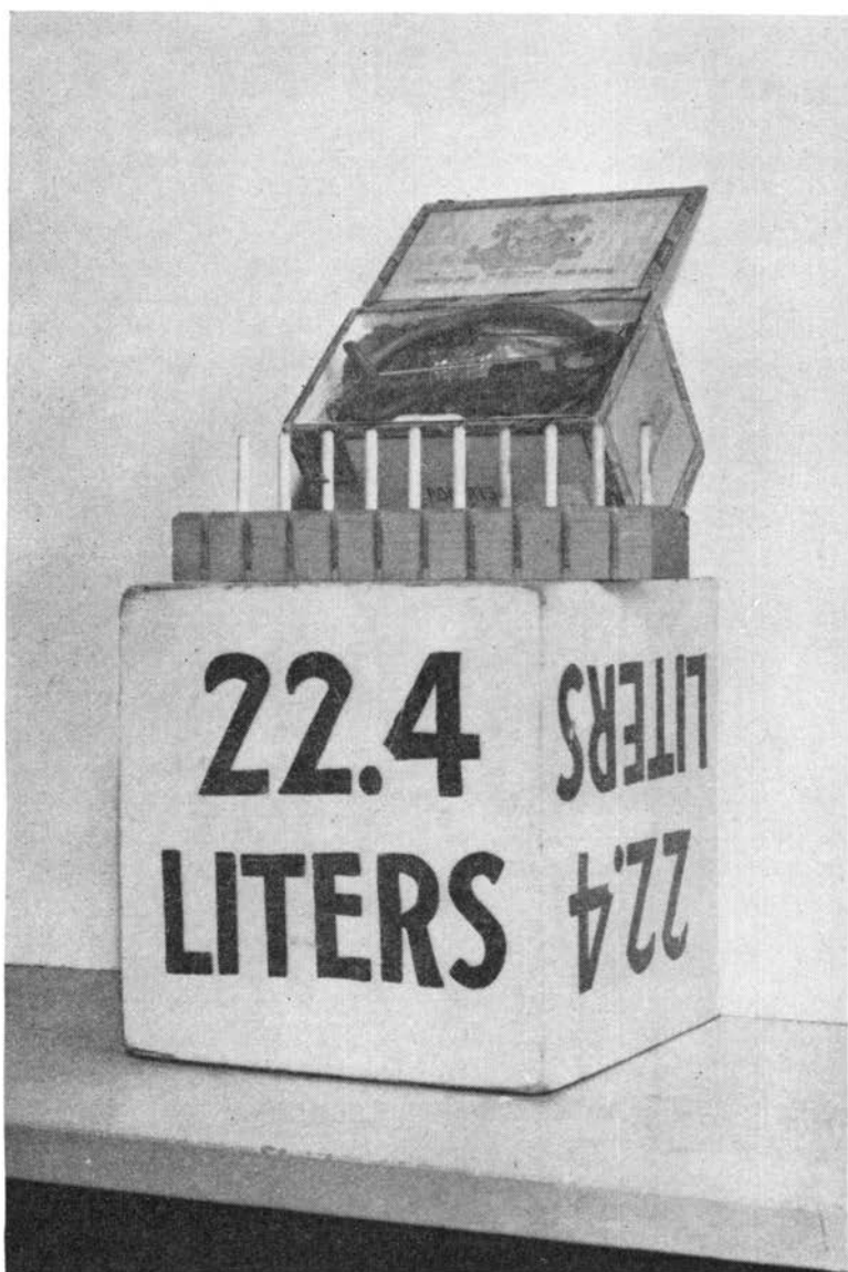
Figure 2. Except for the test tube rack the semimicro apparatus set may be packed in a cigar box having the dimensions 6"x6"x9". The cube is 11" on an edge.

DEPARTMENT OF CHEMISTRY, State University of Iowa.