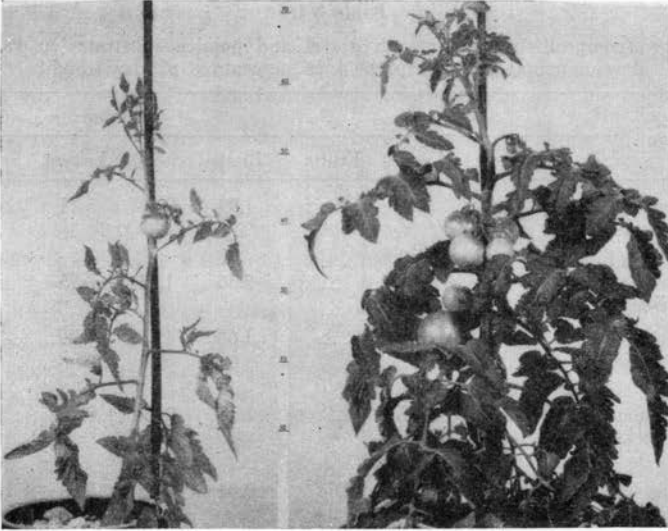
Figure 2. Plants of the pumice (left) and gravel (right) series at mid-fruiting stage.