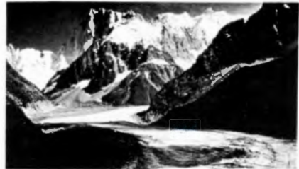
From the Conservation Series

All of the resources of Ward's Geology Division have gone into the production of these fine filmstrips. Photographs of field situations are combined with art work to illustrate important concepts, achieving clarity, accuracy, and simplicity without a mass of confusing detail. Use of these filmstrips produces positive values in student interest and comprehension.