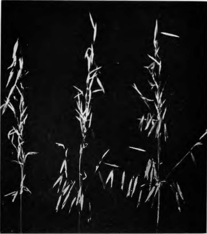
Figure 2. "Atypical" blast of oats.

or about 30-40 days before heading. The oat yield nurseries were planted on April 10, 1957, and varieties with the greatest atypical blast headed on June 14 (Table 2.). Judging from the stage of spikelet development when growth was arrested and these two dates, the factor causing the blasting probably occurred approximately between May 10 and 25. This period was characterized by abnormally cold temperatures and generally cloudy weather. For instance on May 16, 36 days after planting, the maximum temperature did not reach the normal minimum, and minimum readings were below normal for the next several days. Furthermore, the minimum temperature May 27 was 42° F. with clear skies which would have allowed considerable radiation to occur. The temperature of the oat plants could well have been as low as 35° F. under such conditions. These observations suggest that low temperature may have caused the atypical oat blast which occurred in 1957.