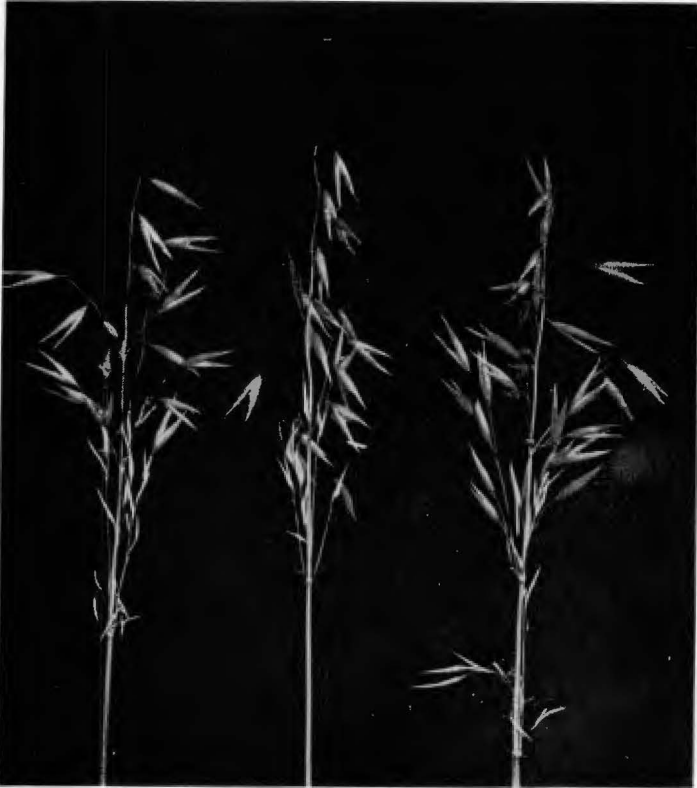
Figure 1. "Normal" blast of oats.

panicle, or in a section of the panicle, were blasted. The upper, middle, or lower portions of a given panicle would be blasted while the remainder of the panicle appeared healthy (Figure 2). The oat crop in 1957 apparently sustained an average amount of "normal" blast plus the "atypical" blast. The condition was striking in fields of lodged grain because the culms bearing atypically blasted panicles stood erect.