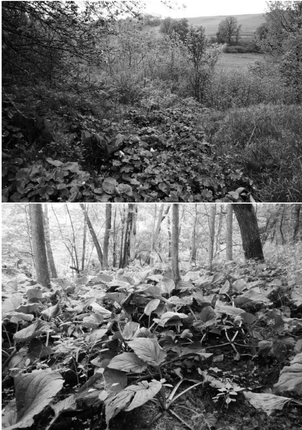
Fig. 1. Photographs of two seeps and environs. Top panel shows Pine Spring seep (PS) looking north, 26 May 2013. Bottom panel shows Zook West seep (ZW), 20 June 2016.

(Mill.) K. Koch), sugar maple ( Acer saccharum Marsh.) and basswood ( Tilia americana L.).