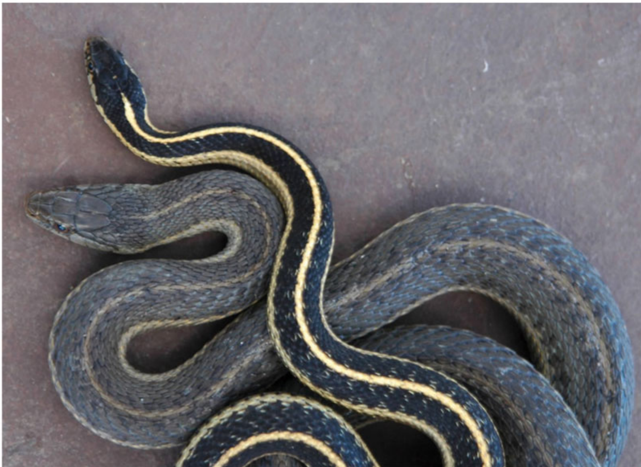
Fast (large bodied) and slow (small bodied) pace-of-life garter snake ecomorphs ( Thamnophis elegans).

The Journal of the Iowa Academy of Science