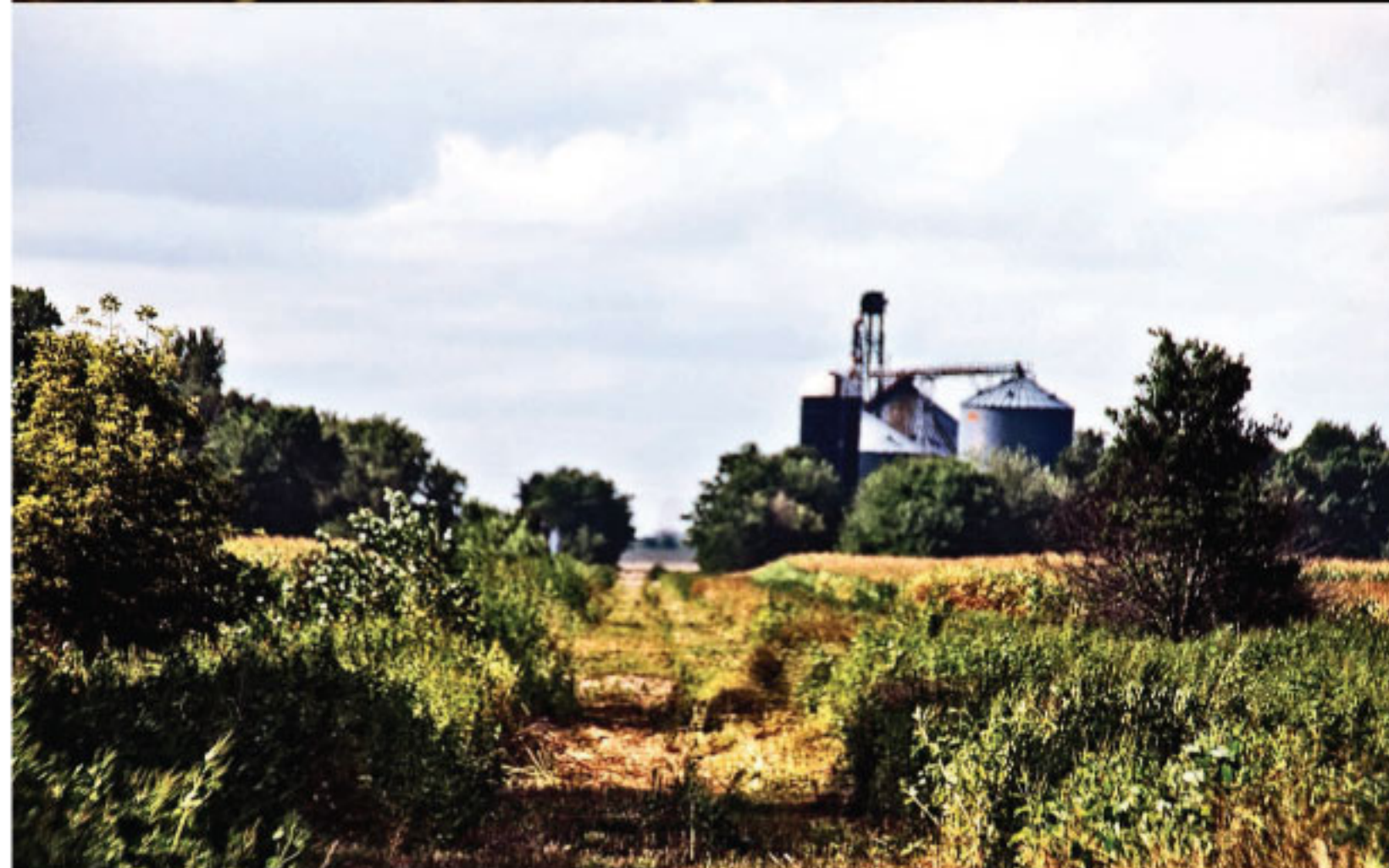
Swaledale railroad prairie ROW in autumn, circa 1987 (top) and similar perspective on 12 August 2012 (bottom). Note the present day railbed without tracks and ties, and the ongoing woody succession over the past decades. The author's hometown, Swaledale, is in the background.