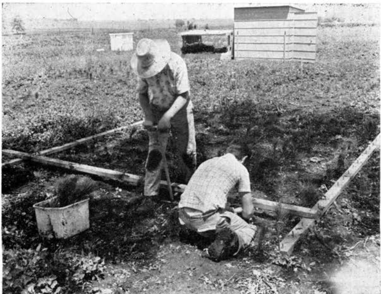
Figure 2. Planting-jig in use. Here one species of a mixed plot is being planted. Planting of the second species in alternate rows is just being started.

(A=desired spacing between plants; B = \frac{1}{2} A; C = 1.75 x A; D = 11.5 x A; E = 9.526 x A)