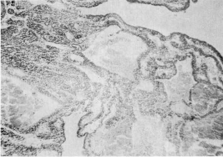
Figure 2. Cytopathological appearance of the cords and masses of epithelial cells in the adenocarcinoma of the mouse mammary gland.

in the controls. Death of the animals could be attributed to secondary infections or to age.