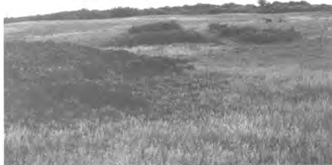
Fig. 4. Looking south from north border showing invasion of smooth sumac into upland field/prairie community.