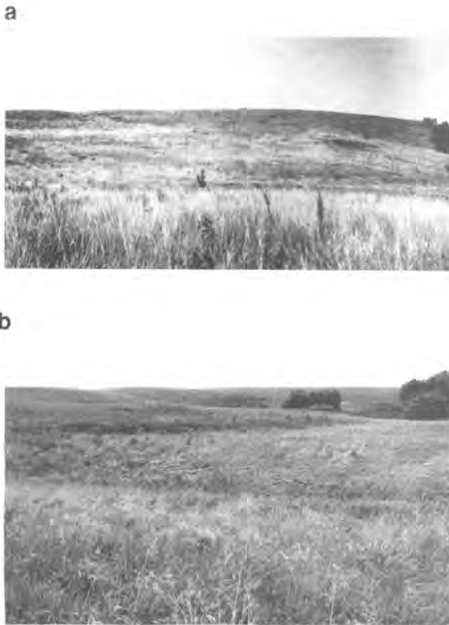
Fig. 2. Looking north from firebreak road. 2a. 1940 from Kendeigh (1941) showing upland field/prairie with little woody vegetation. 2b. 1989 from present study showing a few changes to upland area from this view, but note recently cut box elders in foreground.

in various years, but detected neither species in mid-June 1988 (Lowther 1989) and only 1 territorial male Western Meadowlark and no Grasshopper Sparrows during his census in early June, 1989 (Lowther 1990). Therefore, a decrease in both of these species was evident before our study, and our failure to detect any individuals of these conspicuous species probably meant that the W. Meadowlark seen by Lowther in 1989 did not remain in the North 40 to breed.