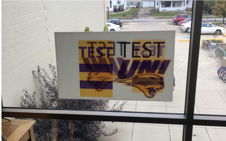
Fig. 1. Initial test with both outward and inward facing designs.

When discussing designs with my client representative, he initially wanted both long-term and short-term window decals. Since their main profit comes from clothing sales, the long-term designs could promote their wearable merchandise. Throughout the year the UNI Bookstore holds several promotions, such as seasonal sales. There are also campus-related events they cater toward, such as homecoming, family weekend, buying textbooks at the beginning of a semester, and selling back textbooks at the end of the semester. My client representative wanted a few window sections to have short-term decals that they could change as they pleased to tailor to different events throughout the year.