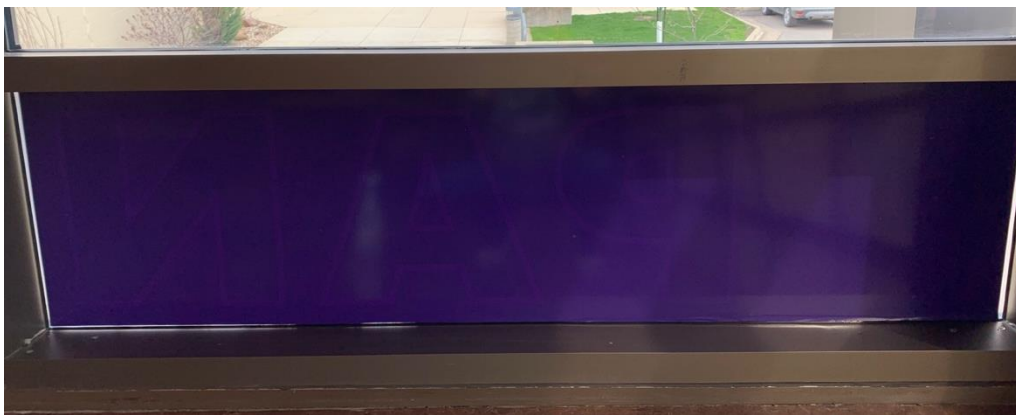
Fig. 8. The interior side of the panel containing the letters “PAN”.

The final product was an advertisement in the rear second-story windows of the UNI Bookstore advertising their UNI spirit. The phrase “Panther Pride” implied that they sell items for both UNI fans and students, such as gameday apparel, UNI paraphernalia, and school supplies. This display marketed to their desired audience and promoted their most popular items for sale. It was eye-catching because vinyl advertisements like this were unique to the area and drew customers into the store. This vinyl window decal doubled the UNI Bookstore’s advertisements on the rear side of their building when coupled with the merchandise they displayed in the first-floor windows. This was unique to the store because they did not have vinyl window decals anywhere else.