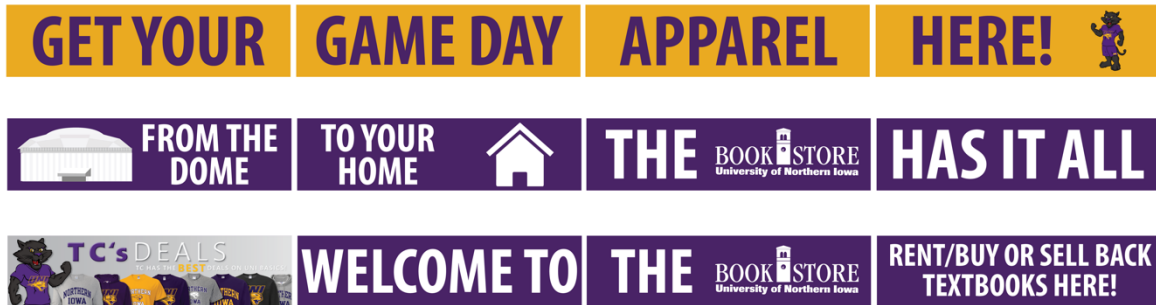
Fig. 2. My designs for the project.

instead (see fig. 3). I mocked up their design on the rear side of the UNI Bookstore using Photoshop (see fig.4) and tweaked the design to best fit the space (see fig. 5).