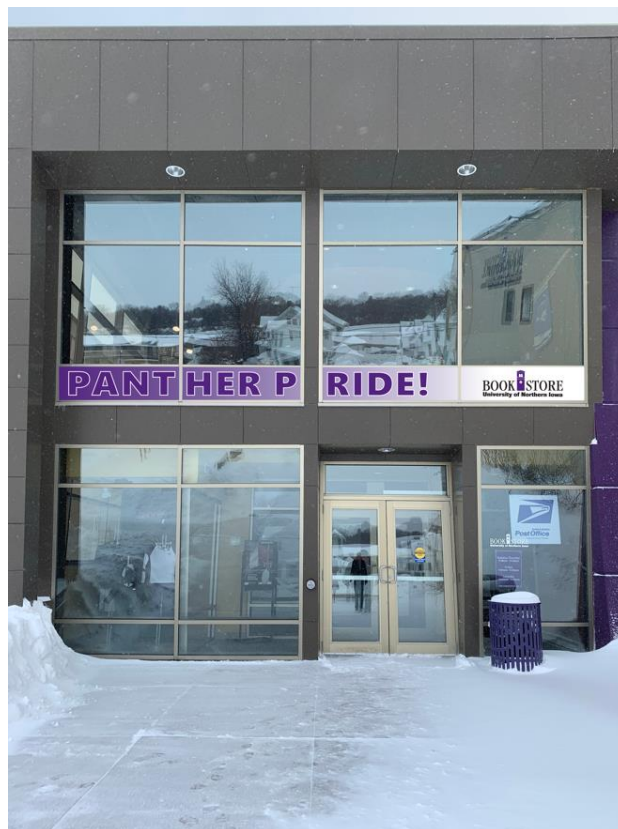
Fig. 4. The client's design mocked up in the UNI Bookstore windows.