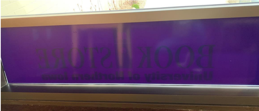
Fig. 7. The interior side of the panel containing the UNI Bookstore logo.