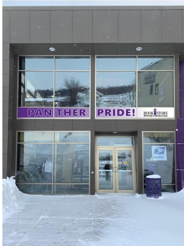
Fig. 5. A mockup of the design altered to better fit the windows' separating columns.

Once the design was approved by my client, I began production. I printed the design onto transparent vinyl. The design was divided into four panels since we applied it across a four-window span. It was important to print the designs in reverse because the side of the vinyl the design was printed on was not the side that would stick to the windows. It was basically like printing on the backside of the material, but the material was see-through so the design looked correct when viewed from the front side. Next, I used the laminator to apply white vinyl and then purple vinyl to the back of the transparent material. I used the laminator because it pressed the materials together to ensure it was applied smoothly with no creases or bumps.