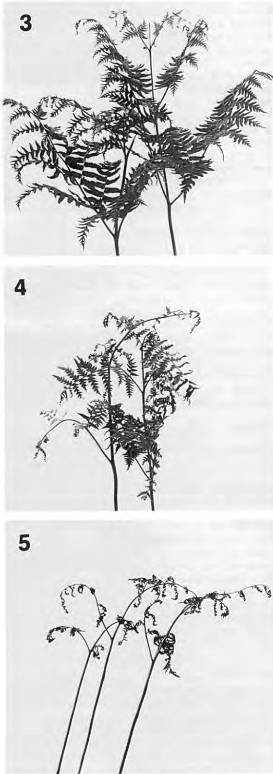
Figs. 3–5. Control and inoculated fronds 10 days after inoculation (Inoculation experiment 2). 3. Control. 4. Inoculated with 1,000 conidia/ml. 5. Inoculated with 2,000 conidia/ml.