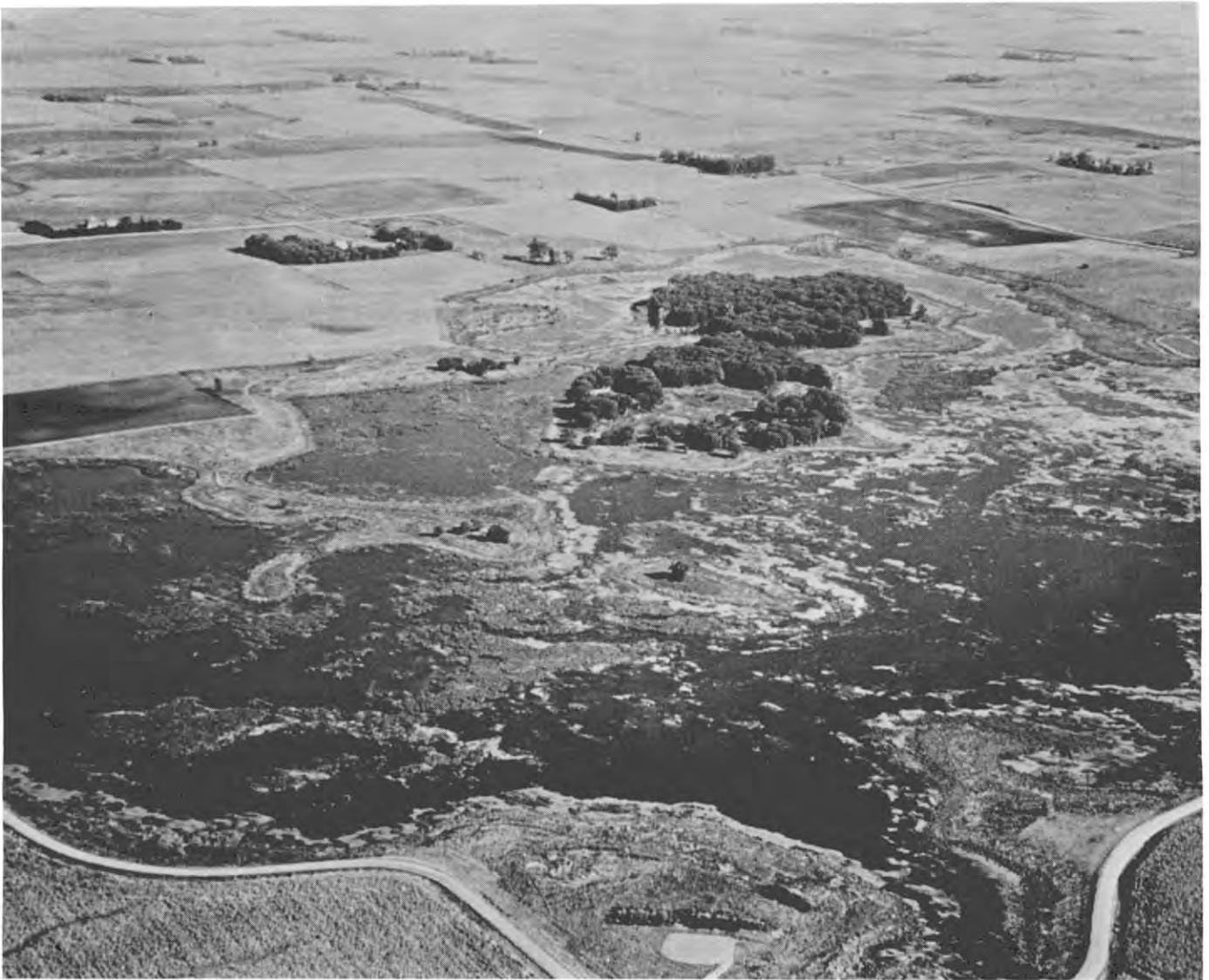
Fig. 3. State-owned type 4 prairie marsh – an island in the midst of agricultural land.

until the next drought. The open stage is not conducive to good wildlife production or to hunting or trapping recreation. Thus, the need to manipulate water levels becomes important. A dike or levee across the outlet to the wetland along with a water control structure allows the manager to artificially raise the water level in marshes which have silted in from excessive erosion or to maintain higher water levels in early spring to ensure water later in the summer. The water table lowered by tiling and drainage precludes the normal feeding of wetlands during the drier summer months. Water control also allows the manager to drain the marsh causing an artificial drought to revegetate an open marsh. Since man is a most impatient creature and the demand for maximum wildlife productivity is a priority, management capabilities are of extreme importance. We can best utilize our remaining marshes by shortening the open water periods and lengthening the productive 50-50 water-vegetative ratio.