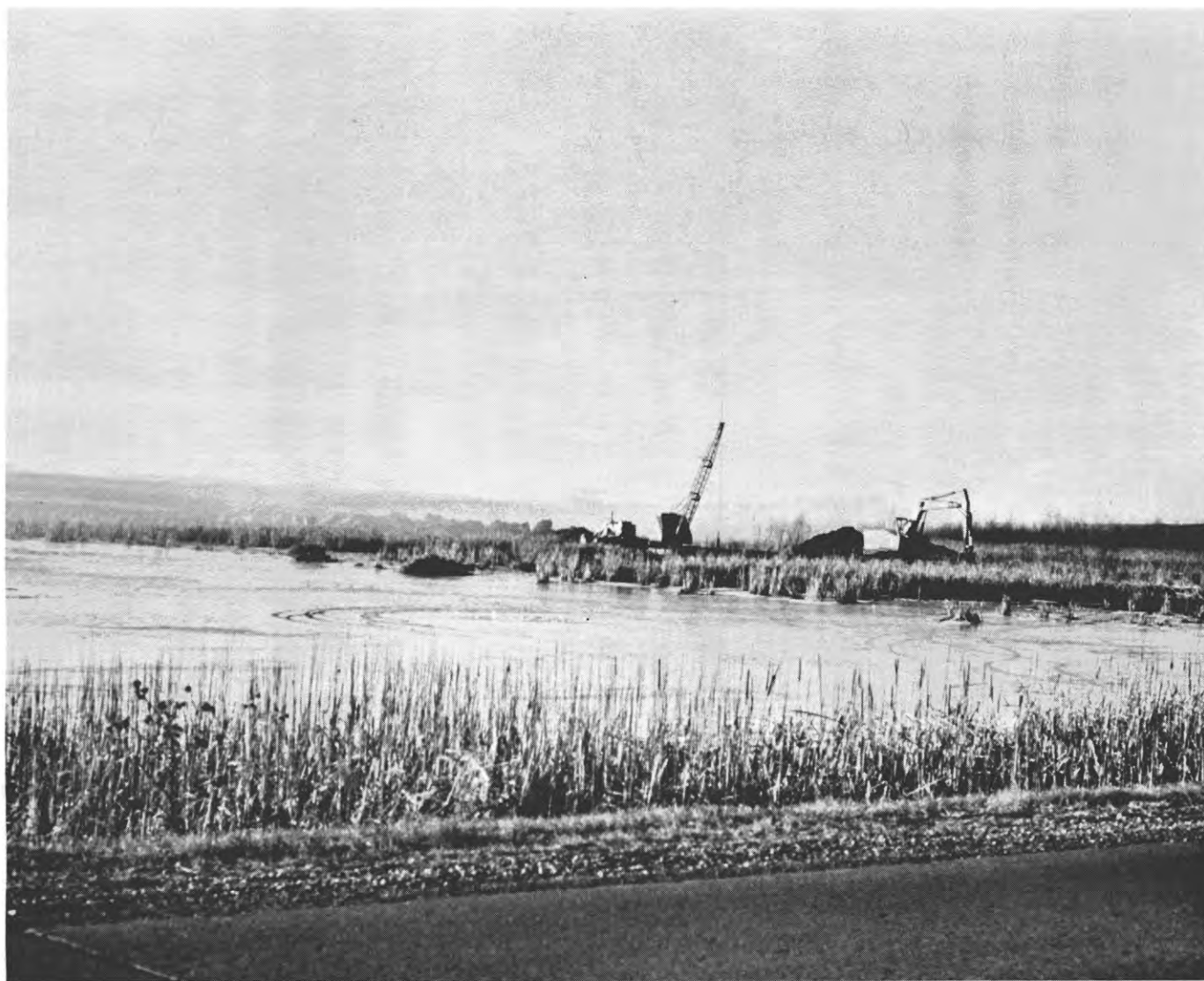
Fig. 2. Prairie marsh being drained by construction of drainage ditch.

action. This natural scenario results in shallowing of wetland basins. Deeper lakes become more shallow, shallow lakes become marshes, marshes transpose into wet meadows, and wet meadows yield to prairie or timberland. When the protective vegetation covering the prairie was destroyed by exploitation, erosion increased drastically and some marshes were destroyed in just a few years by siltation. The natural process has been altered to the point that man must continue to manipulate events to achieve a resemblance of the natural state.