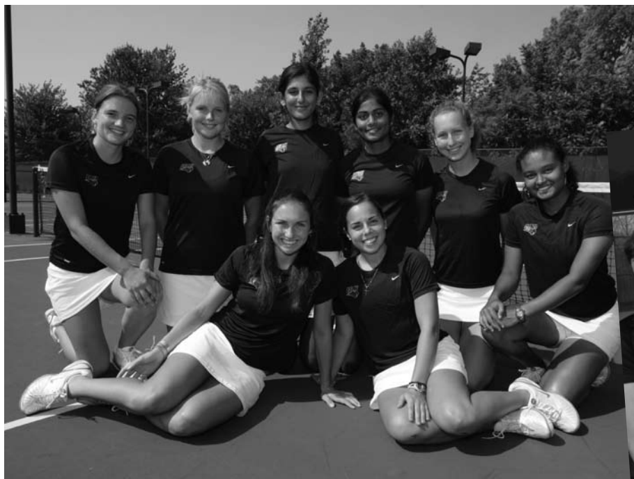
2006-07 UNI Tennis team