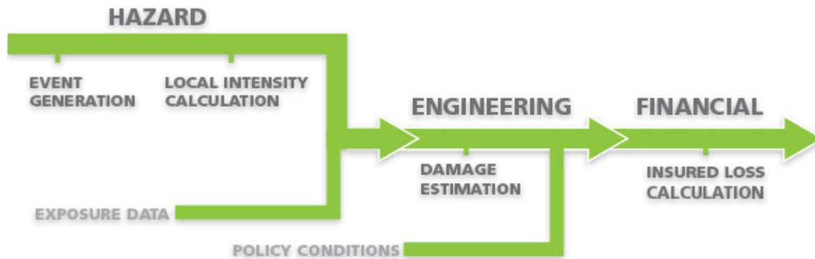
Figure 1. Catastrophe modeling framework. This figure provides a flow chart of the various steps AIR takes when creating a catastrophe model. Adapted from “About Catastrophe Modeling,” by AIR Worldwide, n.d. ( http://www.air-worldwide.com/Models/About-Catastrophe-Modeling/ )

catastrophe modeling process. The output of this model includes probability distributions of losses over a certain time period or in terms of cumulative distribution functions (Grace et al., 2003).