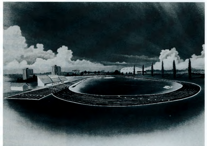
New Outdoor Facility