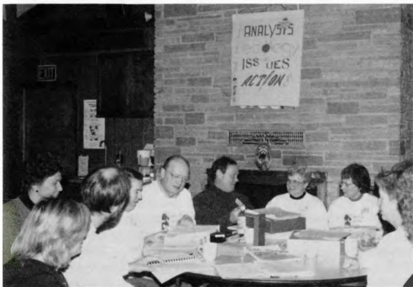
Teachers interact with eii program directors during an in-service workshop.

The directors of eii agree with the many environmental educators who believe our great need today is implementation of those materials already developed.