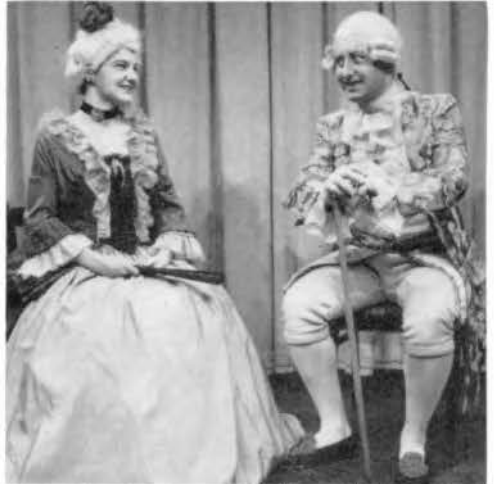
1952—Sir Anthony and Mrs. Malaprop, still crossing swords of witty conversation.