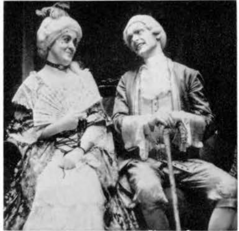
1932—Mrs. Malaprop finds Sir Anthony Absolute so very, very amusing.