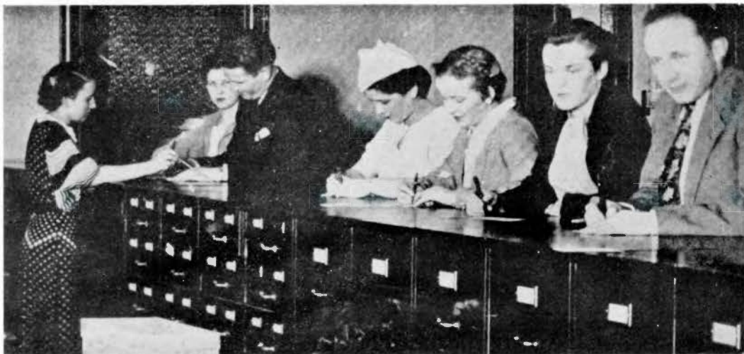
MANY ANXIOUS FACES were seen in the placement bureau back in 1934, when job prospects were anything but bright. Seniors in this group seem to be asking, "Is there anything for me?"

a fat paycheck ranging from $100 to $140 a month.