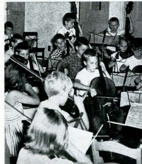
Young Musicians at Work

The qualifications of this expert staff are of the highest order. About one-third of the staff hold doctorate degrees and another one-third have taken at least a year's study beyond the master's degree. All have been selected from among candidates with out-