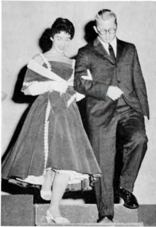
MODELING TWO "CHIC" OUTFITS in a recent college fashion show were these happy students.

IOWA STATE TEACHERS COLLEGE, CEDAR FALLS, IOWA