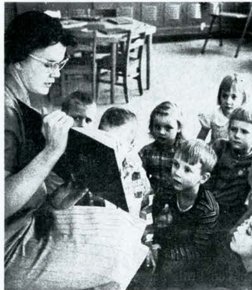
Student Teacher and Pupils

the visitors gather next month for the formal dedication. An open house will be held throughout the day, giving the guests an opportunity to visit the classrooms, laboratories, shops, and physical education facilities.