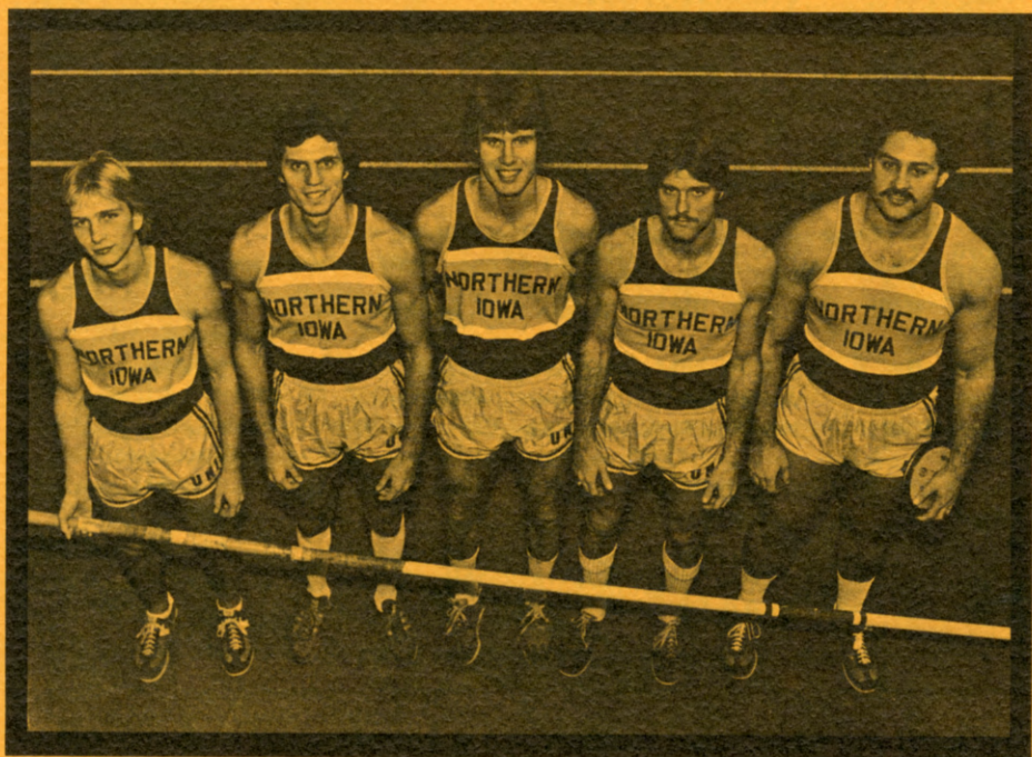
Northern Iowa's 5 returning All-Americans