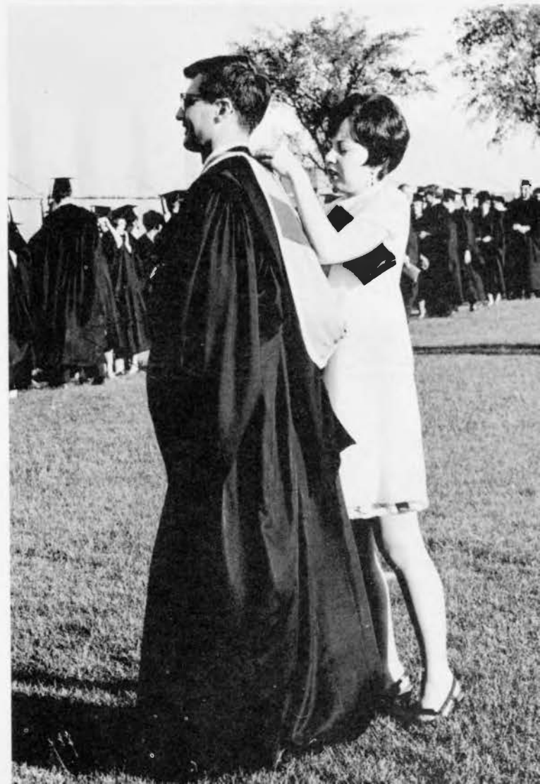
A last-minute adjustment for a master's hood.