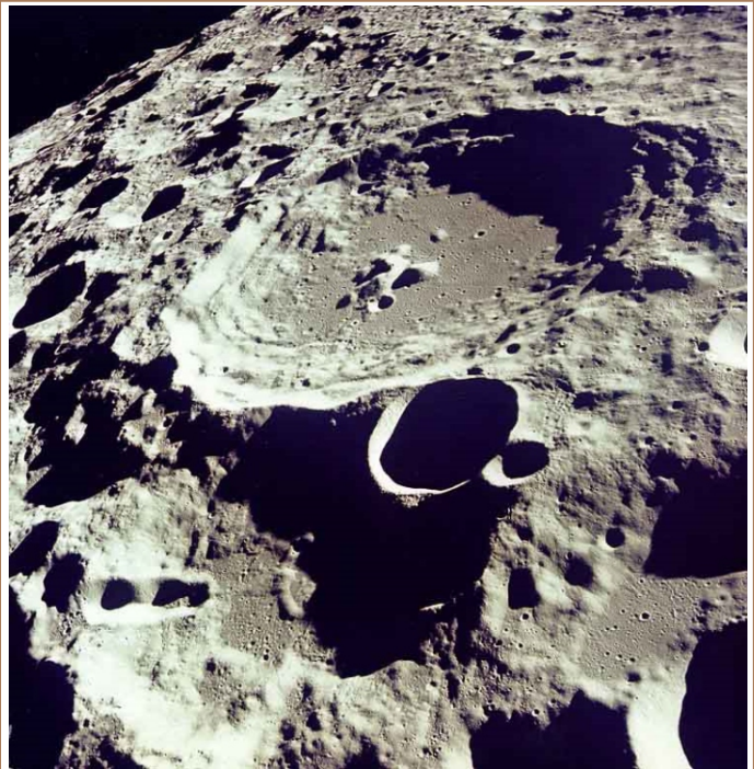
FIGURE 1 Sample image of moon craters.

http://www.nasaimages.org/luna/servlet/detail/NVA2~4~4~4929~105455:Lunar-Farside-from-Apollo-11