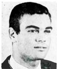
41 - Livingston