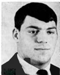
78 - Rater