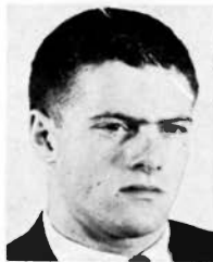
75 - Green