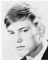
34 - Arduser