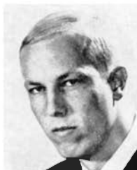
52 - Steen