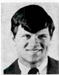
20 - Wagner