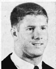
67 - Bellock