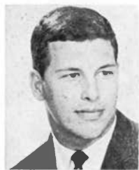
63 - Barbatti