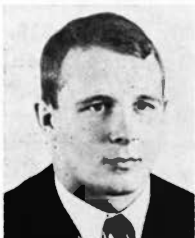
68 - Rudd