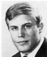
62 - Harken