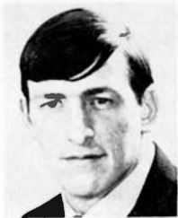
88 - Cox