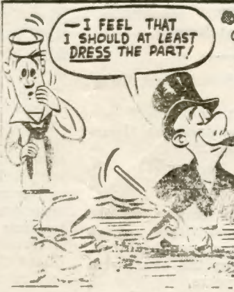
Navy War Bond Cartoon Servi