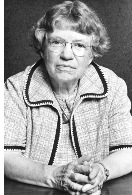
Margaret Mead photographed in 1977.