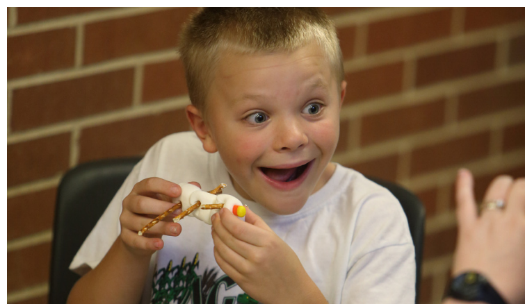
Halloween House