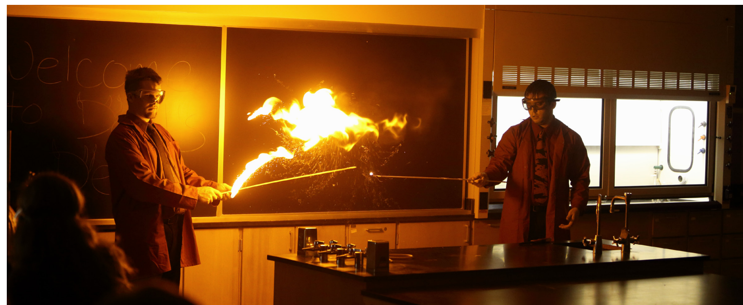
Halloween House