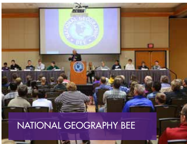
NATIONAL GEOGRAPHY BEE