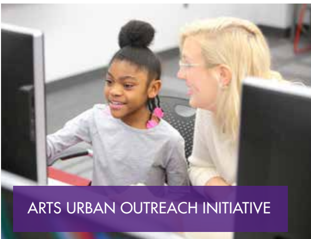
ARTS URBAN OUTREACH INITIATIVE