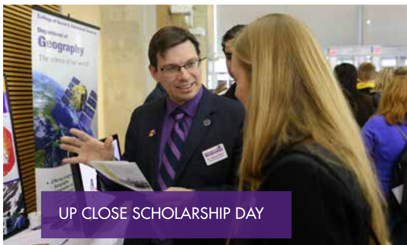
UP CLOSE SCHOLARSHIP DAY