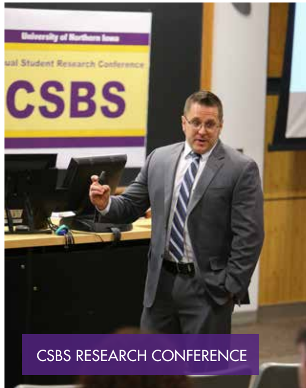
CSBS RESEARCH CONFERENCE