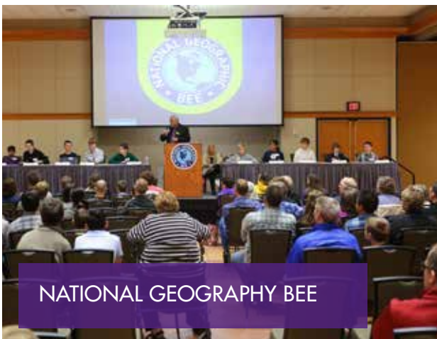
NATIONAL GEOGRAPHY BEE