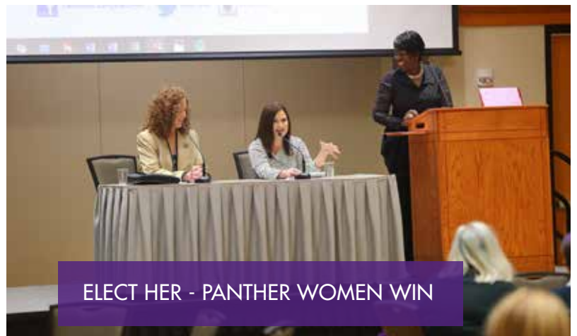
ELECT HER - PANTHER WOMEN WIN