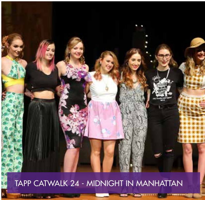
TAPP CATWALK 24 - MIDNIGHT IN MANHATTAN

Reminder: Please share the good work happening in CSBS so we can promote your program along with our college to a broader audience. An email link is provided in CSBS Weekly for your convenience.