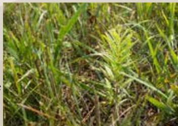
Butterfly milkweed ( Asclepias tuberosa ) seedling

Overall, our results from this year look promising for enhancing grassy roadsides with milkweeds for monarch habitat. Simply planting milkweeds in roadsides may be a cost-effective means of enhancement since they emerged as seedlings relatively well, even without any follow-up management. Still,