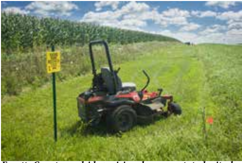
Fayette County roadside prairie enhancement study site during the height of the growing season. A mowed plot is shown in the foreground, and an unmowed plot can be seen in the background.

techniques similar to prairie reconstruction in crop fields. When directly turning grassy roadsides into restored prairie, managers kill established grasses with herbicides, then plant prairie species into the dead sod. However, these methods can be costly and equip-