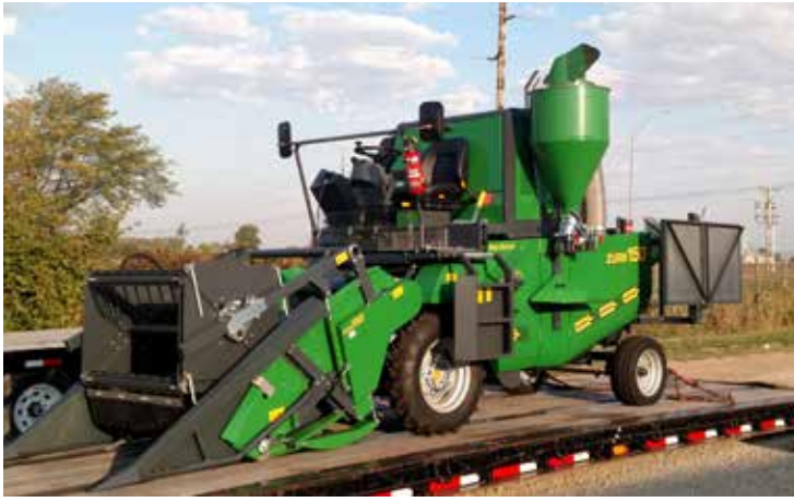
New Zurn 150 research plot combine just being delivered on Friday, September 22, and has already been used to harvest several plots this fall.