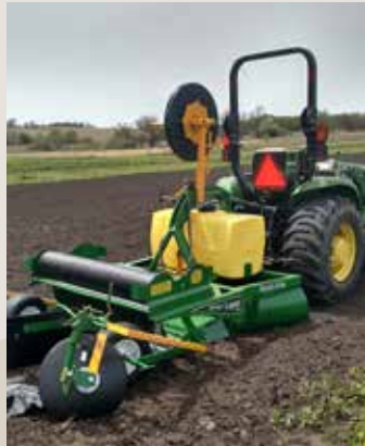
Rainflo bed former/mulch layer for creating plastic mulch covered raised or level beds in tilled ground for transplanting seedling plugs into as seed nurseries.

The Roy J. Carver Charitable Trust Fund generously provided funding to the University of Northern Iowa's Tallgrass Prairie Center (TPC) to replace aging equipment as well as add new equipment and technology to support core programs at the Center, and to enhance student engagement with Center programs and activities. This provides essential infrastructure for student experiences in applied conservation science. The center piece of this program enhancement was the purchase of a new Zurn 150 research plot combine for harvesting native seed from production plots, from grasses to sedges to forbs to shrubs. This replaces a 40-year old Hege plot combine, donated to the Center 17 years ago from Hawkeye Community College. The new combine brings increased efficiency to harvesting and cleaning seed, and perhaps most importantly, greater safety for staff and students in operating the combine harvester. Other equipment essential to native seed production provided by Carver grant include a commercial grade Toro mower (pictured on previous page), a John Deere rototiller and rotary mower for nursery management and research, a Rainflo bed former/mulch layer for setting up seed nursery beds, a new Westrup air-screen cleaner, and a spiral seed separator.