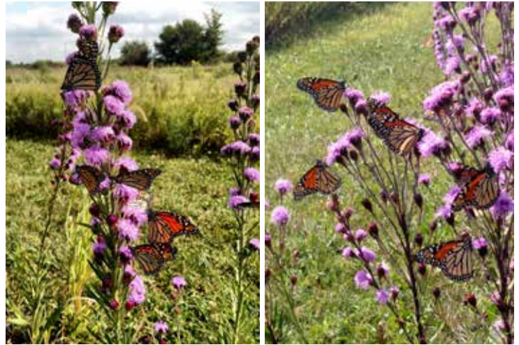
On a sunny mid day in September nearly 100 adult monarchs graced the meadow blazingstar ( Liatris ligulistylis ) seed increase plot at the Center (above photos). About a month later, painted lady butterflies appeared en masse nectaring on goldenrods all around the mid-west. Little is known about their migration. A 70 mile-wide cloud appeared on weather radar over the great plains states this fall.

All seminars will begin at 4:00 p.m. in Classroom 09 at the Tallgrass Prairie Center. These seminars are free of charge and are open to the public.