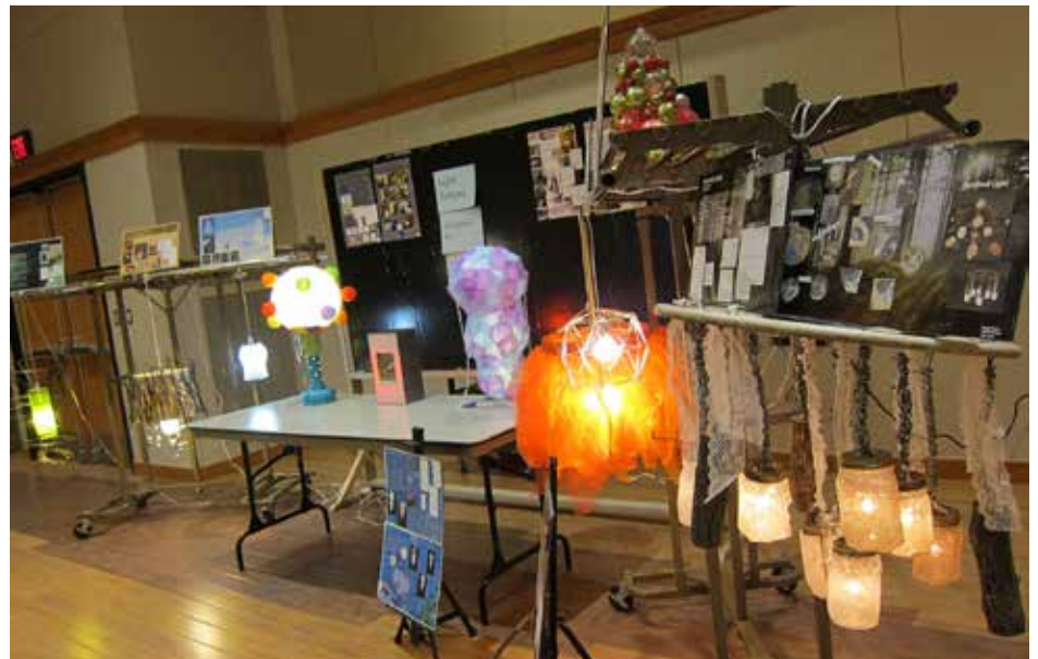
↑ Interior Design lighting exhibit