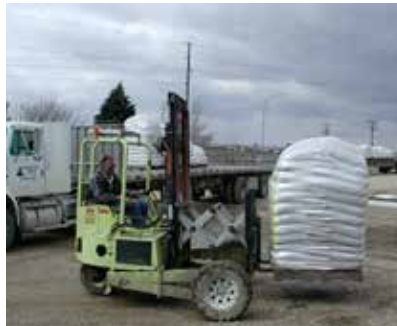
Source-identified native seed being unloaded from semi's at the Tallgrass Prairie Center for distribution to county IRVM programs statewide.