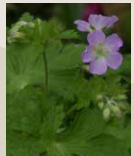
Answer: Geranium maculatum, Wild geranium. Catapult type seedhead in sun-mer and flower and foliage in spring.