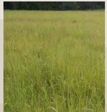
High-diversity ROW seeding, Fayette County IRVM, June 2012 (left). Hydroseeded in 2007 using seed from UNI's Native Seed Distribution Program. Low-diversity seeding, Cedar River Natural Area biomass research plot, Black Hawk CCB (right).

The Tallgrass Prairie Center is currently working on a prairie seed calculator to provide a way for folks to develop their own custom prairie seed mixes. The seed calculator will assist you with appropriate species selection for your planting site, help assemble a seed mix that includes all guilds, determine appropriate seeding rates and the quantity of PLS seed needed for each species in the mix, and give you a cost estimate of your mix (based on the current years commercial nursery retail cost). This web based program will be free and available on our website in 2015.