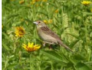
Dickcissel density declined by 98%

Floral resource availability in the severely flooded plots dropped dramatically and was seasonally delayed. These changes in the plant community affected butterfly use of the flooded plots. While butterfly abundance declined site-wide in 2013 and 2014 compared to previous years, the magnitude of decline was lowest on the unflooded sandy loam (~39%), intermediate on the moderately flooded loam (~65%), and greatest on the severely flooded clay loam (~80%).