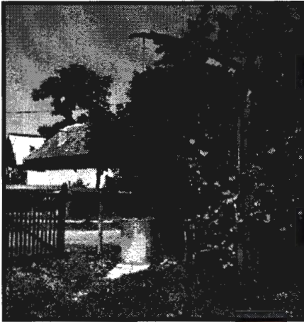
Figure 1: Typical open, lever-arm well