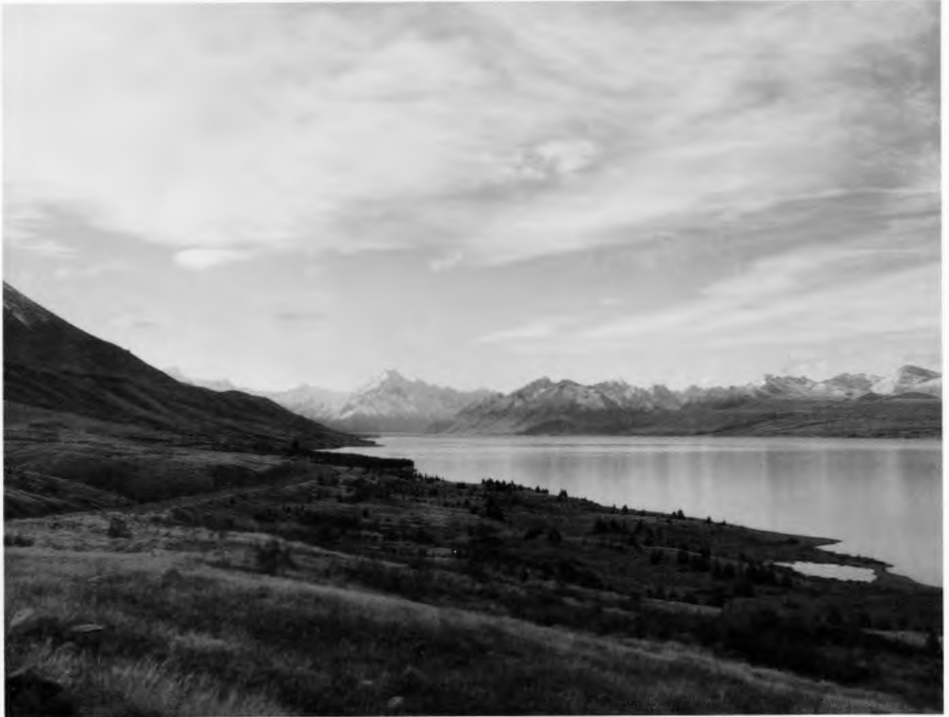
Lake Topelo, New Zealand with Mt. Cook, by Irving Herman