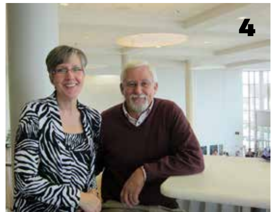
Thanks to all the faculty, staff, students, and friends who helped make the 2012-2013 year successful.