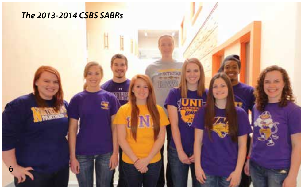
The 2013-2014 CSBS SABRs

CSBS has announced the inaugural members of its new Social and Behavioral Representatives (SABRs) student group, which will represent the college in the 2013-2014 academic year.