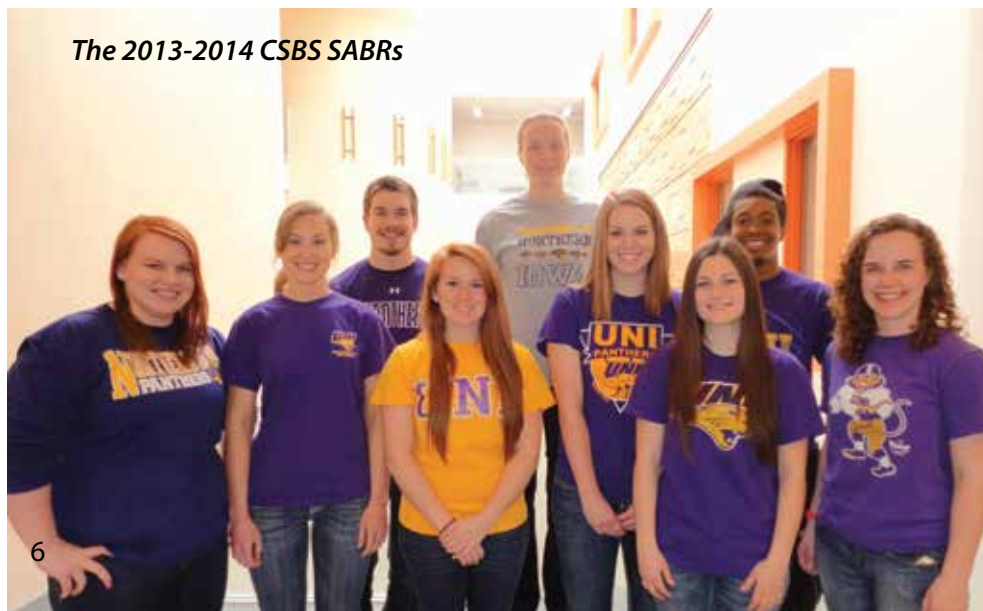
The 2013-2014 CSBS SABRs

CSBS has announced the inaugural members of its new Social and Behavioral Representatives (SABRs) student group, which will represent the college in the 2013-2014 academic year.