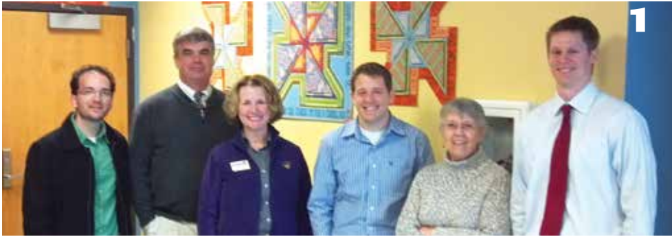
1. Faculty and staff traveled in December to YESS, the Youth Emergency Shelter Services in Des Moines.