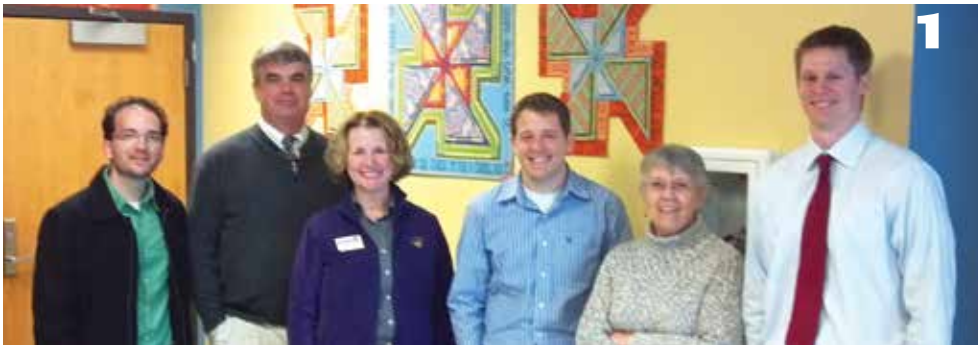
1. Faculty and staff traveled in December to YESS, the Youth Emergency Shelter Services in Des Moines.