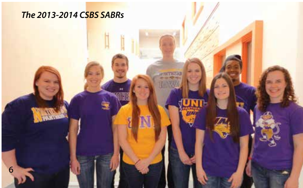
The 2013-2014 CSBS SABRs

CSBS has announced the inaugural members of its new Social and Behavioral Representatives (SABRs) student group, which will represent the college in the 2013-2014 academic year.