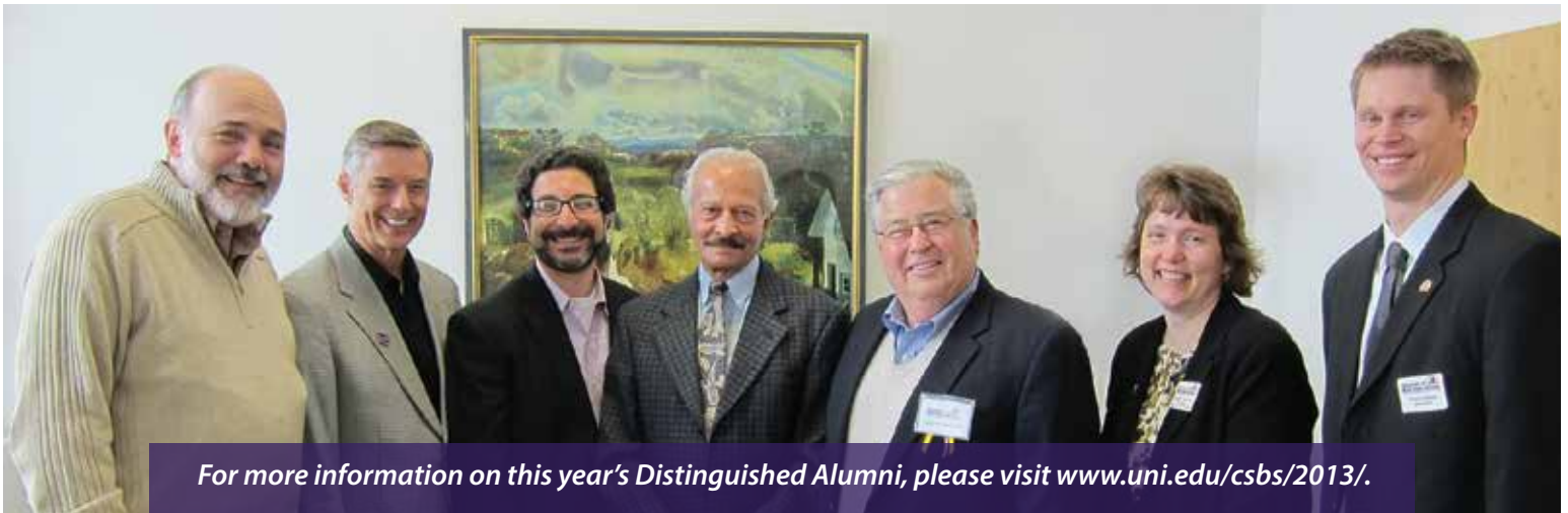
For more information on this year's Distinguished Alumni, please visit www.uni.edu/csbs/2013/ .