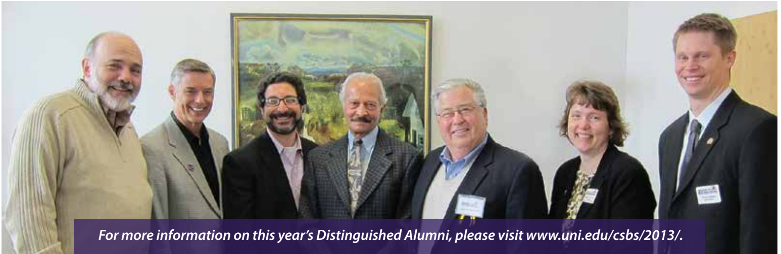
For more information on this year's Distinguished Alumni, please visit www.uni.edu/csbs/2013/ .