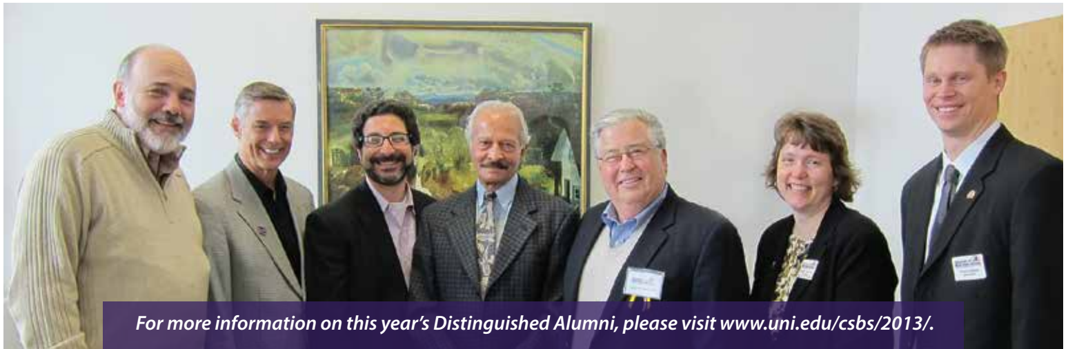
For more information on this year's Distinguished Alumni, please visit www.uni.edu/csbs/2013/ .