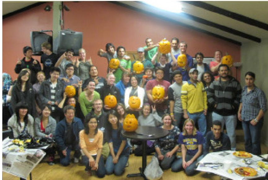
CIEP students and their Conversation Partners display their pumpkins.