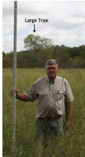
Figure 2. Same planting and location as in Figure 1. In the drought summer of 2012, forbs dried up by mid summer and grasses comprised most of the above ground growth by late summer. Photo taken late August 2012.