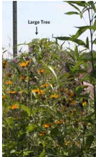
Figure 1. Stand of 16 species of grasses and forbs planted in spring 2009. Forb rich growth occurred in summer 2011 when precipitation was near the 30-year average. Photo taken late August 2011.

Questions/comments? Email: dave.williams@uni.edu