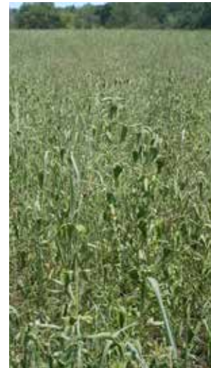
Figure 3. Same planting and location as in Figures 1 and 2. Note the severe wilting (drought stress) on the forbs. Photo was taken in early July during the drought of 2012.