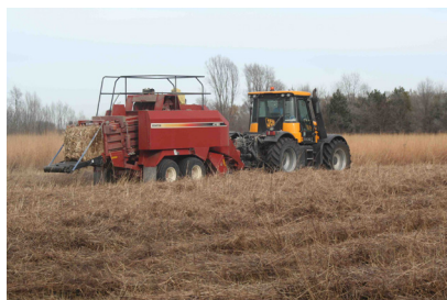
Baling prairie hay in fall