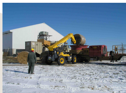
Bale grinder and cubing machine