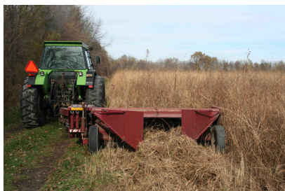
Cutting prairie hay in fall

From an economic standpoint, burning prairie hay will