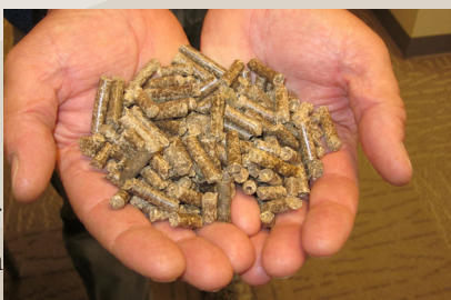
Pelletized prairie power fuel