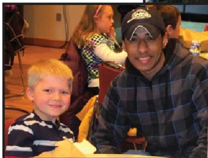
Once a year, students participate in the Read-In project where students get the chance to read to local elementary students.

Each semester, CIEP students meet with academic students and discuss differences in culture as part of class exchanges.