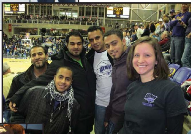
CIEP students support their fellow Panthers during the basketball season.