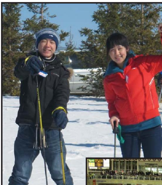
CIEP students try out their skiing skills during a trip to Sundown Mountain in Dubuque, Iowa.