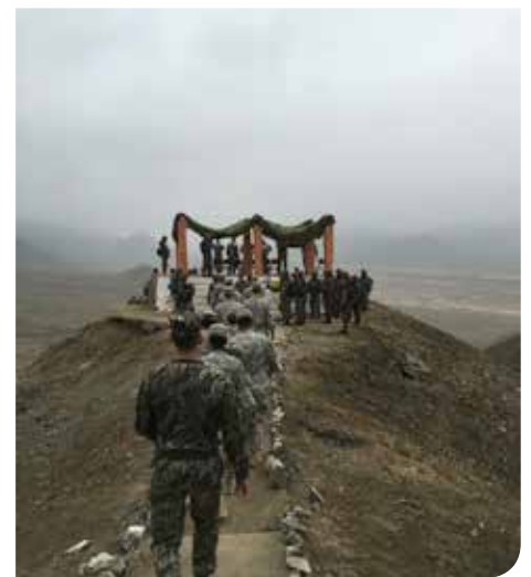
Top Left: While shopping in a local market cadets joined local Peruvian children playing with a soccer ball; Top Right: Peruvian and U.S. cadets pose for a picture while on a field training exercise in the desert near Lima, Peru; Bottom Left: Peruvian cadets give a demonstration on the firing some of their 105mm artillery; Bottom Middle: US cadets participated in the firing of Peruvian artillery; Bottom Right: US cadets walked to the top of a hill to observe Peruvian cadets train to call for fire. Targets were set up down range so Peruvian cadets could practice adjusting their fire.