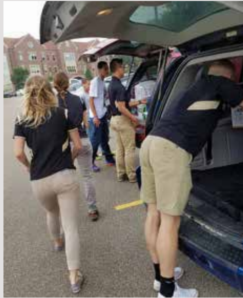
UD cadets help unload a SUV during move-in day