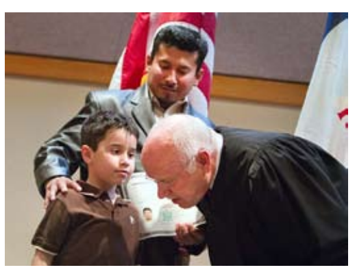
Hon. Jon S. Scoles, U.S. magistrate judge, speaks with new U.S. citizens.

of Iowa, the US Marshall Service, and the Department of Homeland Security Citizenship and Immigration Services office in Des Moines.