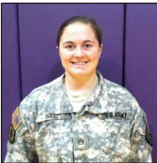
Cadet of the Year