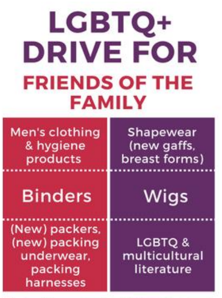
bring items to the LGBT* Center!

Friends of the Family is a local organization that provides safe shelter, confidential services, and housing assistance to individuals in crisis due to homelessness, domestic violence, sexual assault, and human trafficking. LGBTQ+ individuals are disproportionately affected by all of these issues. Friends of the Family is currently seeking items that are often essential to those who identify as LGBTQ+, and particularly those who are transgender.