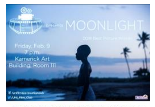
The tender, heartbreaking story of a young man's struggle to find himself, told across three defining chapters in his life as he experiences the ecstasy, pain, and beauty of falling in love, while grappling with his own sexuality.