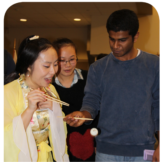
TRAVEL THE WORLD