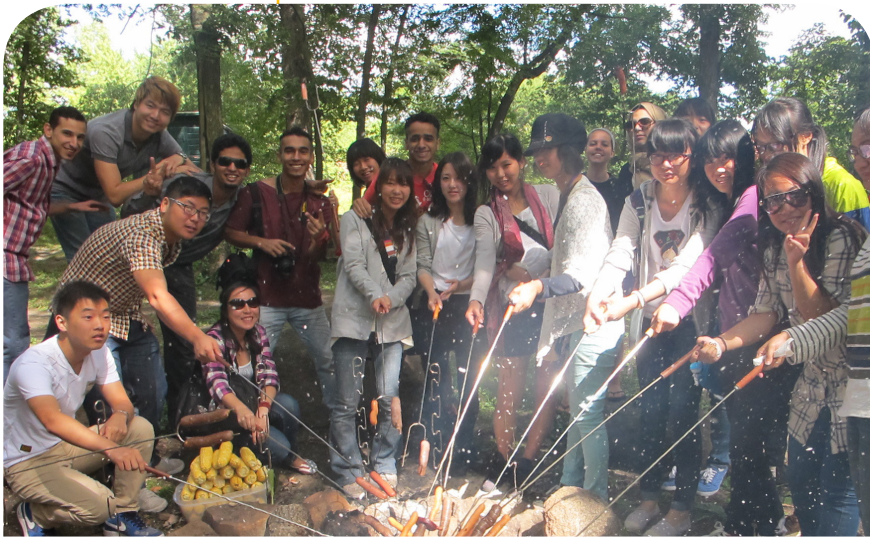
SCHRAGE FARM TRIP