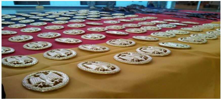
Pictured above are the Gold German Armed Forces Proficiency Badges that can be worn on ACUs or ASUs.

More pictures from these events and stories from the campus news and the local station KWVL can be found on our Facebook Page!