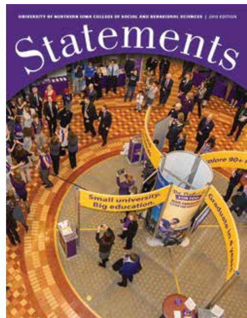
Cover: The first-ever "UNI Day" was held at the Iowa statehouse on February 11. Thanks to the students, faculty, and staff who braved the wintry roads and spent the day at the capitol reminding Iowa's decision-makers of our value to the state.