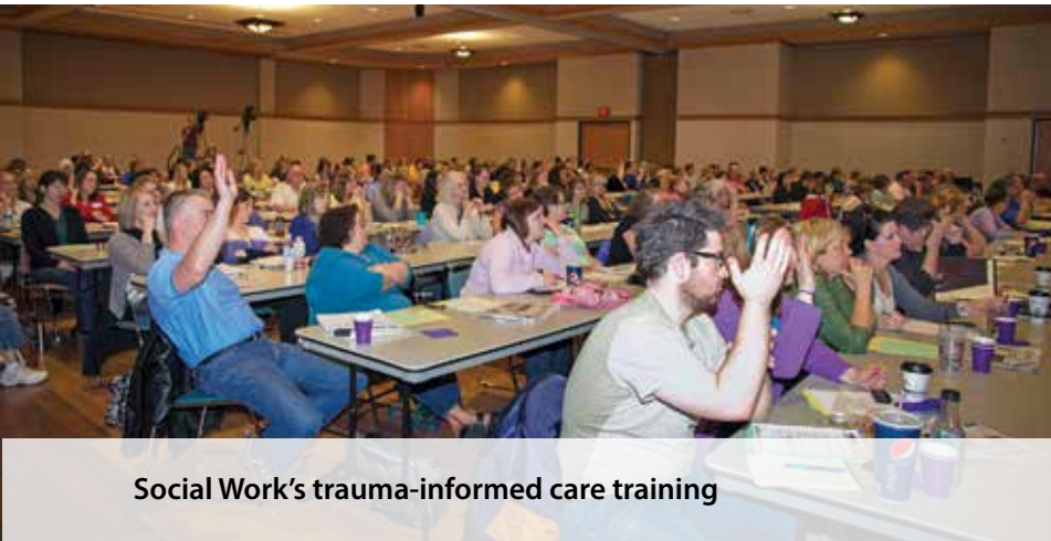
Social Work's trauma-informed care training

Trainers from the federal Substance Abuse and Mental Health Services Administration (SAMHSA) provided training on trauma-informed care to students, community members, and faculty in April. Over 300 people attended the training, which places emphasis on service providers understanding how various trauma-inducing experiences affect individuals. The training was sponsored by the Department of Social Work, which also holds an annual fall colloquium that provides continuing education to professionals in the field.