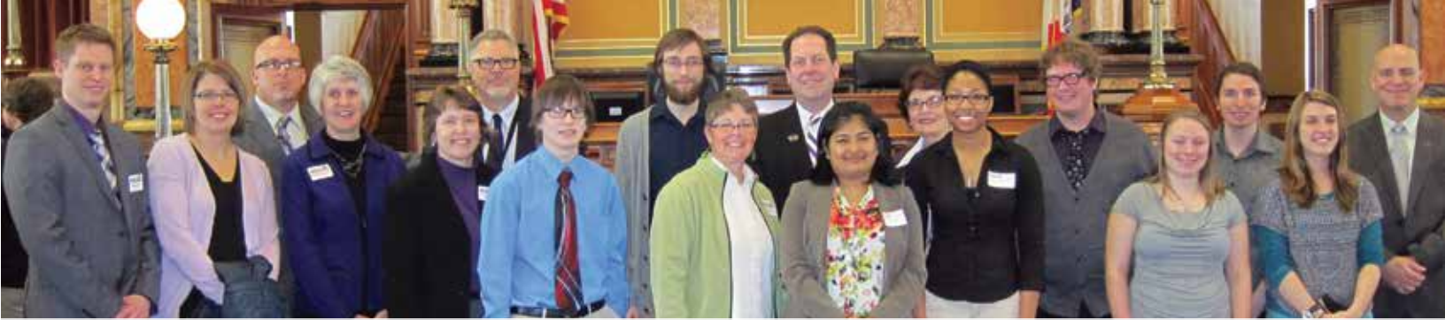
Alumni, friends, faculty, staff, and students attended UNI Day at the Iowa statehouse in February. The purpose of the day was to promote UNI's state-wide value to the legislators.