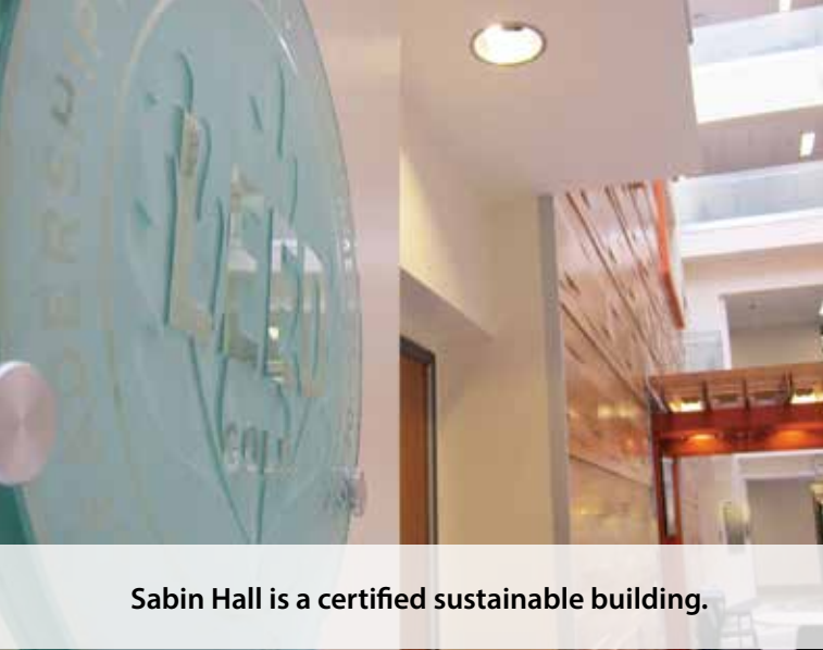
Sabin Hall is a certified sustainable building.

The Sabin Hall renovation project , completed in 2011, was recently awarded Gold LEED certification by the U.S. Green Building Council. This third-party endorsement in Leadership in Energy and Environmental Design verifies that the college's primary classroom building is a sustainable facility. Sabin is the first LEED-certified building on campus.