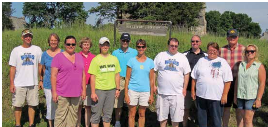
Geographic Alliance of Iowa workshop participants at the Iowa Lakeside Laboratory, an educational field station for Iowa's state universities.

The Geographic Alliance of Iowa (GAI) offered six professional development opportunities for K-12 educators in Iowa in the past year. This included co-hosting a new workshop, with UNI's Center for Holocaust and Genocide Education and University of Iowa's Center for Human Rights, which focused on geographic aspects of conflict and human rights. The GAI continued its commitment to provide statewide professional development by holding two workshops outside our local area, one in south-central Iowa (Chariton) and one in northwest Iowa (Okoboji).