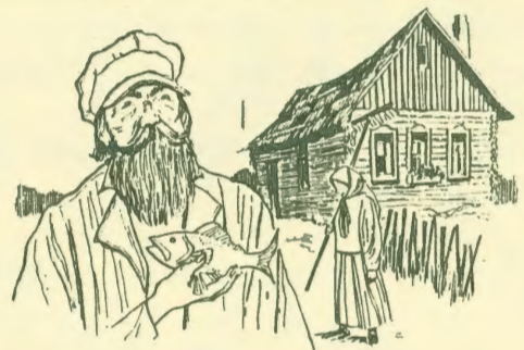
The Golden Fish of the Sea

With the recent changes in Eastern Europe, this topic is not only of great interest to the children but very timely as well. The resident Soviet students will have the opportunity to participate in this study and provide the children with first-hand information about the U.S.S.R.