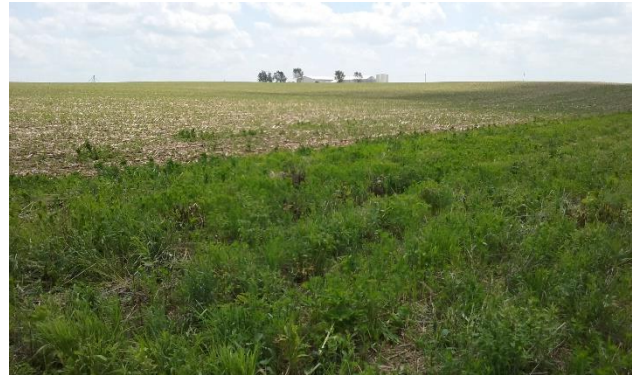
Figure 6. An establishing CRP planting

Several weaknesses have been identified: 1) clients often purchase mixes different from what is in the plan and potentially not meeting standards; 2) seed plans that are on file may not accurately reflect what was actually planted, although some clients bring their new seed mix to the NRCS office; 3) discrepancies between the plan and planting make it hard to evaluate success; 4) rewriting plans after the fact and obtaining information on what was planted is extra work (inefficient); 5) gaps in communication from the NRCS employee to the client to the seed dealer may result in dealers supplying mixes that do not meet standard and program requirements; and 6) inconsistencies between county offices in how seeding plans are written and certified.