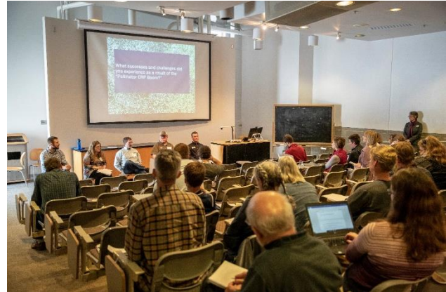
Figure 1. Five panelists, representing different stakeholder groups, presented their perspectives on successes and challenges due to the “Pollinator CRP boom.”

During the Pollinator CRP boom, CP-42 was in high demand for CRP. Customers could gain points on their applications for using pollinator mixes, and rental rates were high. One challenge was for the NRCS to coordinate needs between customers and the seed industry. In the first year, before NRCS had clear guidance in place, 140,000 acres went in to CP-42. Another major challenge was converting expiring CRP planted in non-native cool season grasses to pollinator habitat. At the time, NRCS did not have good approaches for this.