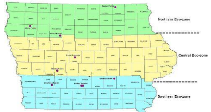
Figure 3. The three latitudinal zones used in the Iowa Ecotype Project

One producer questioned the rationale behind the three geographic zones in the Iowa yellow tag program and asked about the scientific research supporting that approach. The intent is to capture and sustain the genetic diversity of native plant populations remaining in the state by developing foundation seed and encouraging production and use of Iowa source-ID seed. This is a value to the public in that it preserves the natural heritage of the state and creates a “gene bank on the roadsides.”