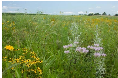
Figure 8. Grasses and forbs flowering in the second year after planting

When landowners make decisions about seed mixes for CRP plantings, cost is one of the biggest factors they consider. One native seed and service provider shared that some people put "junk seeds" in the mix to cut costs while still meeting program requirements. He also questioned the standard for planting 40 seeds per square foot. Other participants shared that this was a common practice that was done for the sake of cost but was not based on research.