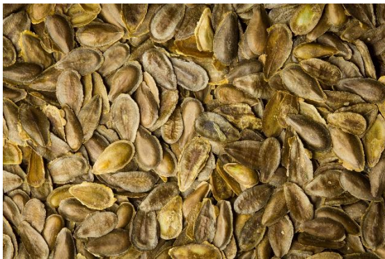
Figure 2. Seed of swamp milkweed, Asclepias incarnata, in demand due to its role as larval host for the monarch butterfly

There was a preliminary, smaller meeting a few weeks before this one to hash out issues brought about due to ICIA changes in approved seed testing labs following the accidental introduction of Palmer amaranth. ICIA and the DOT were concerned about reliability of purity tests from private seed labs. Their initial reaction was to restrict testing for yellow tag seed to only the Iowa State University Seed Lab, then in April 2018 the Illinois Crop Improvement Association, South Dakota State University Seed Testing Lab, and Wisconsin Crop Improvement Association were added. Recently, Minnesota Crop Improvement Association, Indiana Crop Improvement Association, and North Dakota State Seed Department seed testing labs were added to the approved list.