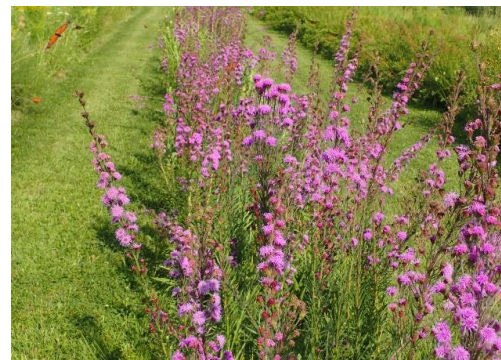
Figure 7. A production plot of meadow blazingstar, Liatris ligulistylis , at the Tallgrass Prairie Center

Pathogens, insects, and soil fertility declines were suggested as possible causes of productivity losses. These effects may