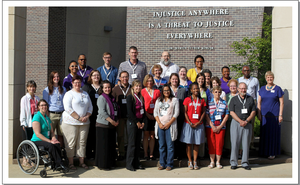
Members of the UNI-National Coalition Building Institute team gathered for an annual retreat on August 15.

To date, more than 1,000 UNI campus members have completed a diversity inclusion workshop facilitated by the UNI-National Coalition Building Institute (NCBI), a team of 40 volunteer students, staff, faculty and administrators certified by NCBI.org. Among workshop alumni are university administrators, resident assistants, and summer orientation student staff.