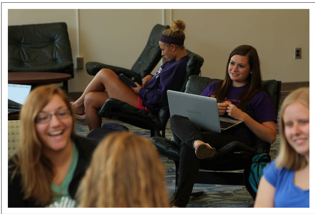
Students enjoy the variety of educational benefits available at Rod Library's new Learning Commons.

Learning and the Liberal Arts Core offices have moved into the library's third floor, providing faculty services related to innovative instruction. Rod Library is also interested in hosting faculty and student presentations of the products of their research and is already seeing growing demand for the building's meeting spaces.