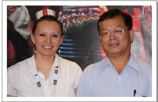
Ms. Pushetonequa with a leader of the Saisiyat tribe

"It's a beautiful thing to travel to the other side of the world and meet people who are just like us in many ways. It felt good to see that there are others who see the world in a similar way that tribal people in the U.S. do. I only wish we were closer to allow more