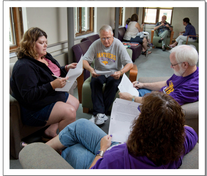
Participants exchange ideas during the Iowa Writing Project. The IWP's Teacher Leader Initiative was just one enterprise receiving a seed grant from UNI.

Many such ventures have qualified for seed funding. Last year, the Office of Research and Sponsored Programs (RSP) received more than 50 suggestions