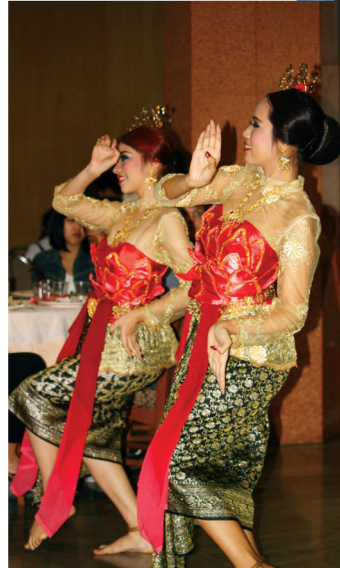
Dancers perform for UNI students at Srinakharinwirot University.

A Jazz Band One student tries on a traditional rice paddy hat.