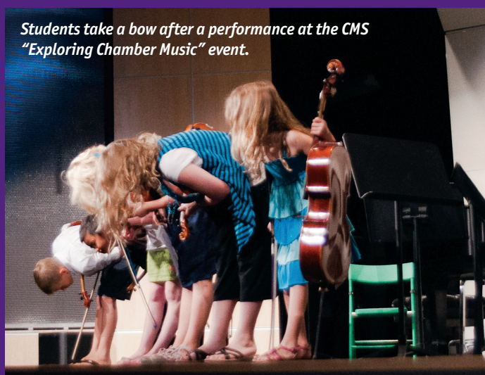
Students take a bow after a performance at the CMS "Exploring Chamber Music" event.