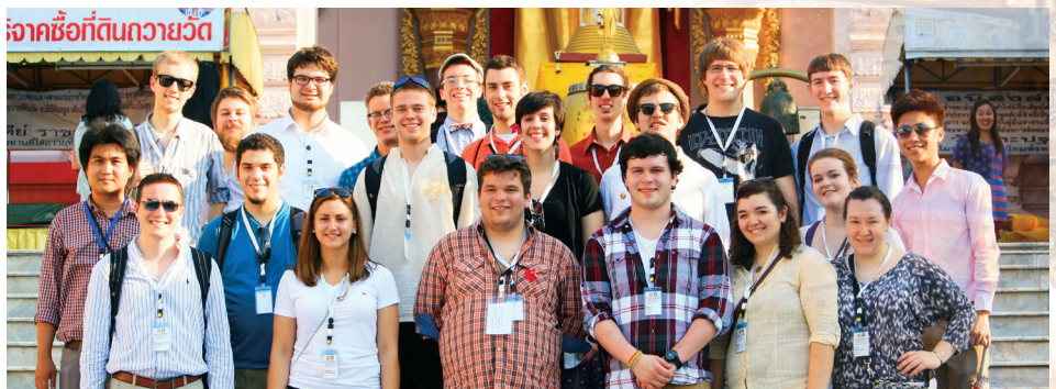
Jazz Band One visits Phra Prathom Jedi, the largest pagoda in Thailand, located in Nakhon Pathom.